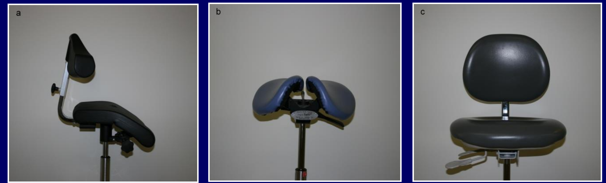
Fig. 1a: Ghopec Junior b: Salli MultiAdjuster c: A-dec Doctor's stool

Based on these findings, to maintain neutral posture and simultaneously reduce spinal loading, the Ghopec is considered the most suitable of the 3 stools investigated.